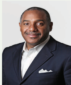
Darion Culbertson, Mayor

The past few months have been a whirlwind of activity around Town Hall. Chief among that activity is the Council and Staff working through strategic initiatives and the related Budget for the next fiscal year. We plan to continue to live within our means and thus no property tax increases is planned for the upcoming fiscal year. However, with a 62% increase in water rates from the North Texas Municipal Water District over the prior 6-years, there is a proposed 15% increase for water rates. Based on the average usage of 15,000 gallons, this increase will raise the average water bill by approximately $9/month.